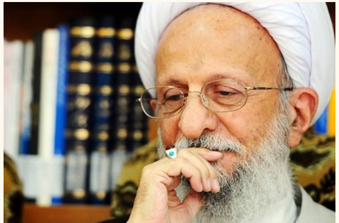
Ayatullah Misbah Yazdi